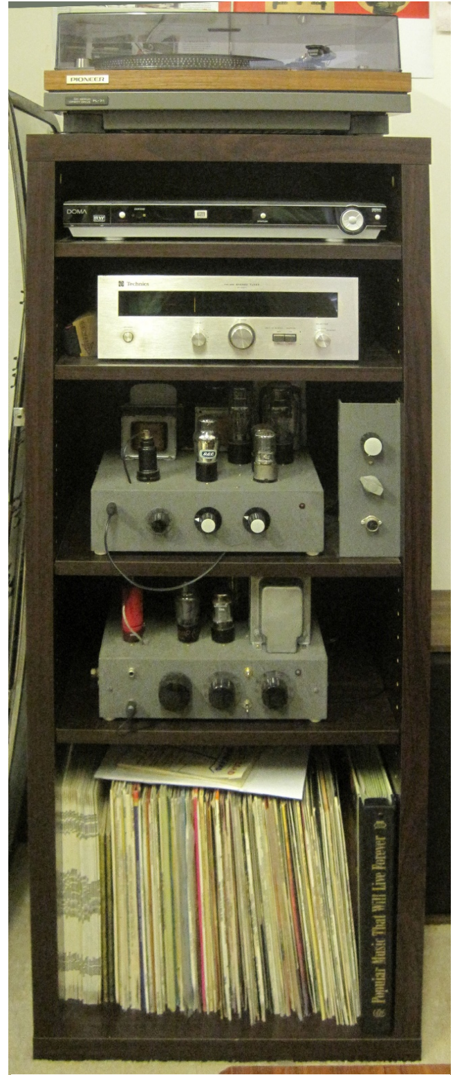
Figure 3. Lee Paltridge's stereo system.

You can contact Peter on 8271 0048, or via email at pholland@senet.com.au