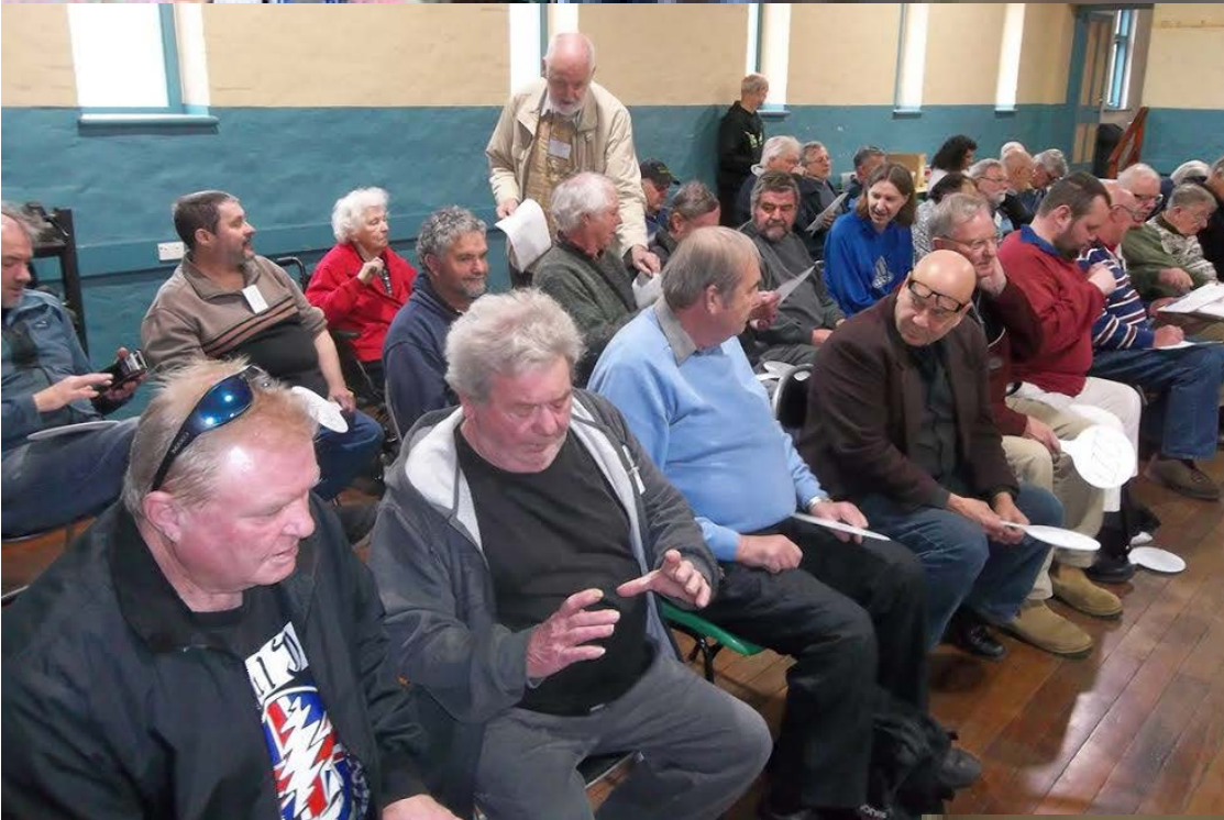
Above – A part of the crowd at the auction following the AGM.